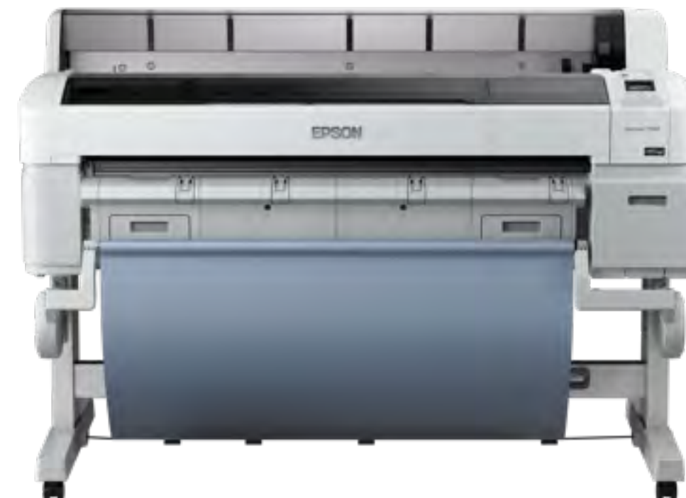
SureColor T7000 - 44"