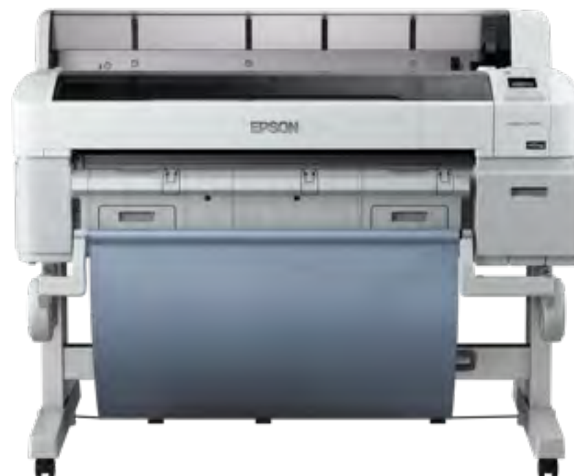
SureColor T5000 - 36"