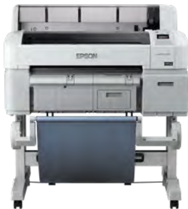
SureColor T3000 - 24"